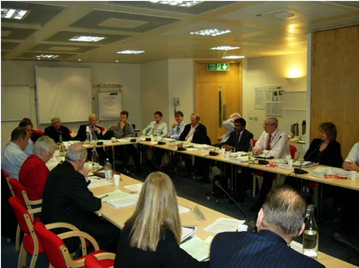
The Committee in session.

The Department of Finance and Personnel, Northern Ireland